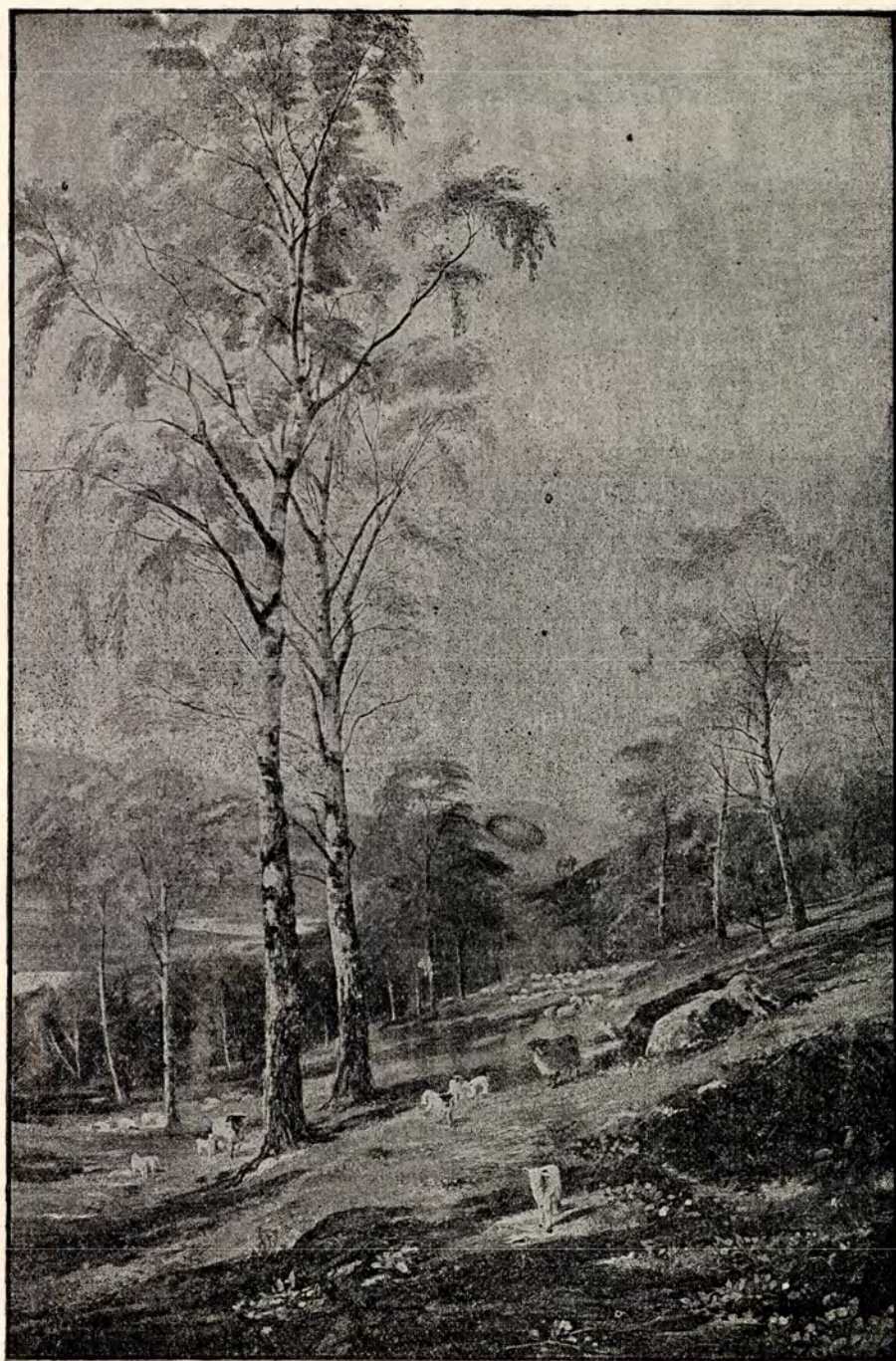
AN AUSTRALIAN LANDSCAPE.

BY PERMISSION OF BUCHER ENGRAVING CO., COLUMBUS, O.