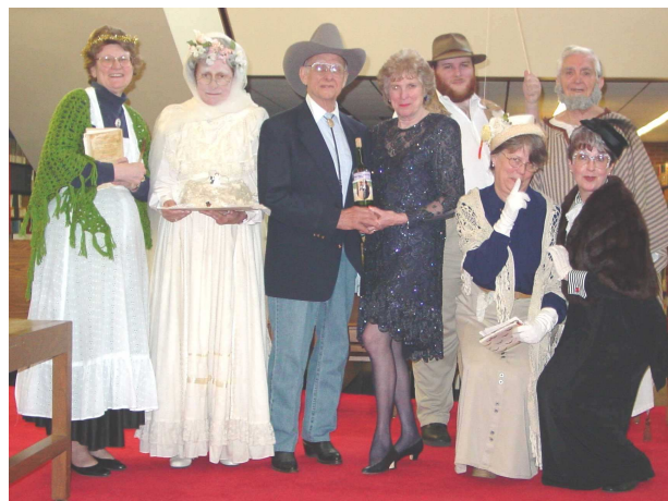
A short business meeting was held at the end of our event.