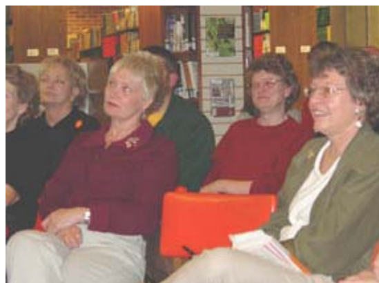
The audience enjoys Ozeki's presentation.