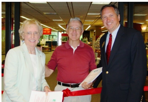
A ribbon cutting ceremony kicked-off the occasion!