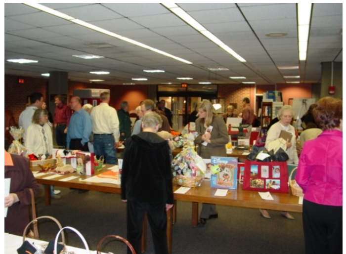
Items of all shapes and sizes were donated and bid upon by guests. All proceeds will go to the Otterbein Archives.