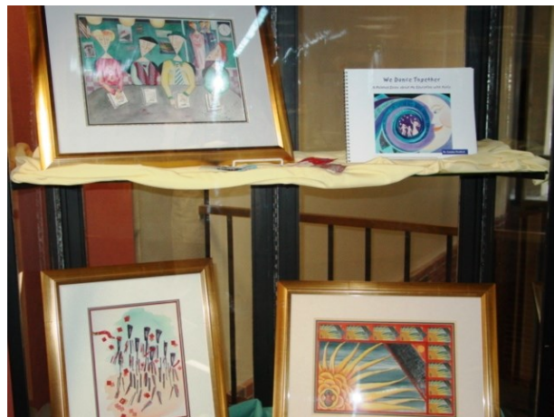
Samples of Candee Basford's art, including her book.