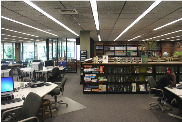
1st Floor Before