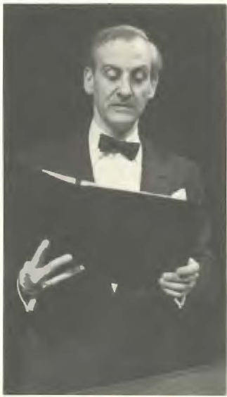
Hans Conreid, Guest Star, "John Brown's Body," 1962