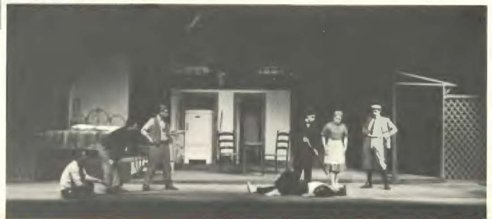
"Death of A Salesman," 1962