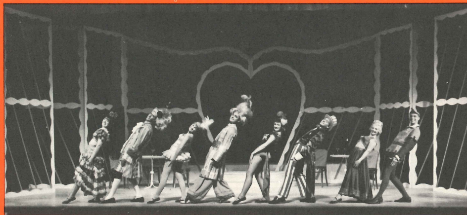
"The Boy Friend," 1961