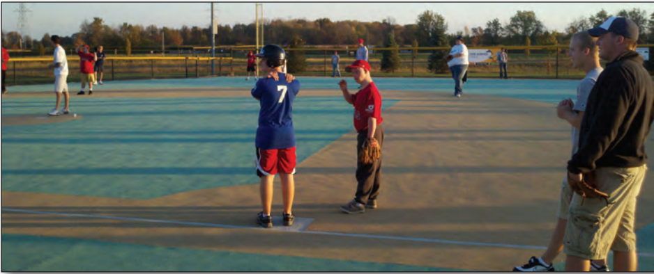
Otterbein baseball players work with young players of the Miracle League.

located in Westerville founded on the principles of providing a truly inclusive environment for children with autism. The annual spring service project involves the entire team and coaching staff in cleanup activities as well as painting and building maintenance. In addition, every team member and coach volunteers a minimum of one day throughout the spring to work with Oakstone students one-on-one.