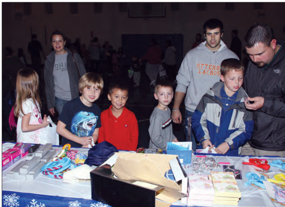
Men's lacrosse team members participate in the Wilder Elementary School Secret Santa event this past November.

were able to spend on the gifts, and run games for the students to play.