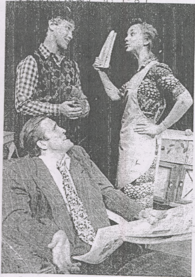
Young Eugene's funny and touching memories of growing up in a Jewish family from Brooklyn come alive in Otterbein College Theatre's production of Brighton Beach Memoirs Oct. 8-11 and 15-17 in Cowan Hall. Opening performance will be 7:30 p.m. Oct. 8, with a 2 p.m. matinee Oct. 11. All other performances are at 8 p.m. For more information, call the Cowan Hall box office at 898-1109 1-4:30 p.m.

8 C O P Y F R O M O C T O B E R 1 9 8 7 OCT. 8-11 and 15-17 — Brighton Beach Memoirs, 7:30 p.m. Oct. 8; 8 p.m. all other performances and 2 p.m. Sunday matinee, Cowan Hall, Otterbein College, Westerville. 898-1657.