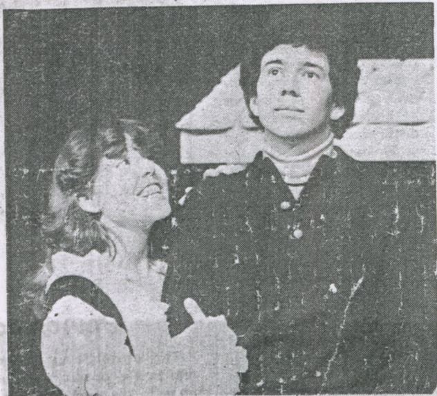
BRIGADOON TO OPEN

Tickets are available at the Cowan Hall Box Office from 1-4:30 p.m. weekdays. The box office reopens at 7 p.m. the evening of each performance.