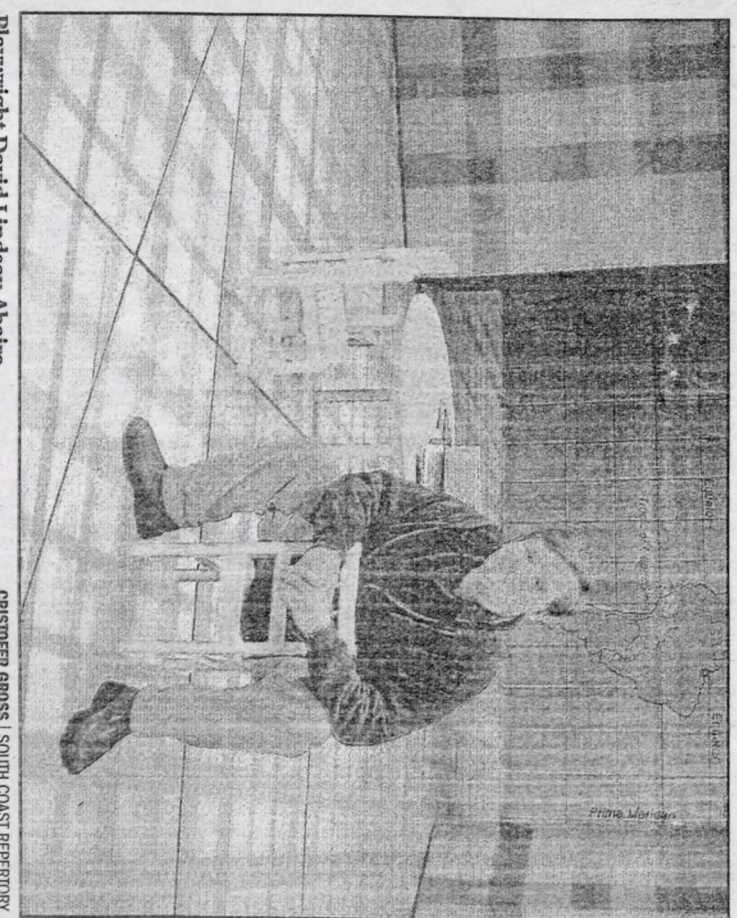
Playwright David Lindsay-Abaire