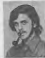
By Dan Budd

Look over our present society. Do you notice how much of it is built on the idea of fear? In other words, you do something out of the fear of the consequences of not doing it or not doing it in the way you are expected to do it. Do you see definite drawbacks to such a system?