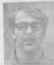
By Brett Moorhead

considerably against Hiram. Perfect passes were dropped in the Wittenberg game that if caught could have resulted in Cardinal touchdowns that would have greatly changed the score. The Otter receivers have the speed to get open but they forget to apply enough glue to their hands before the game.