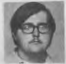
By Thom Barlow

Donation for the lecture is $1.50 and $3.00 for the workshop.