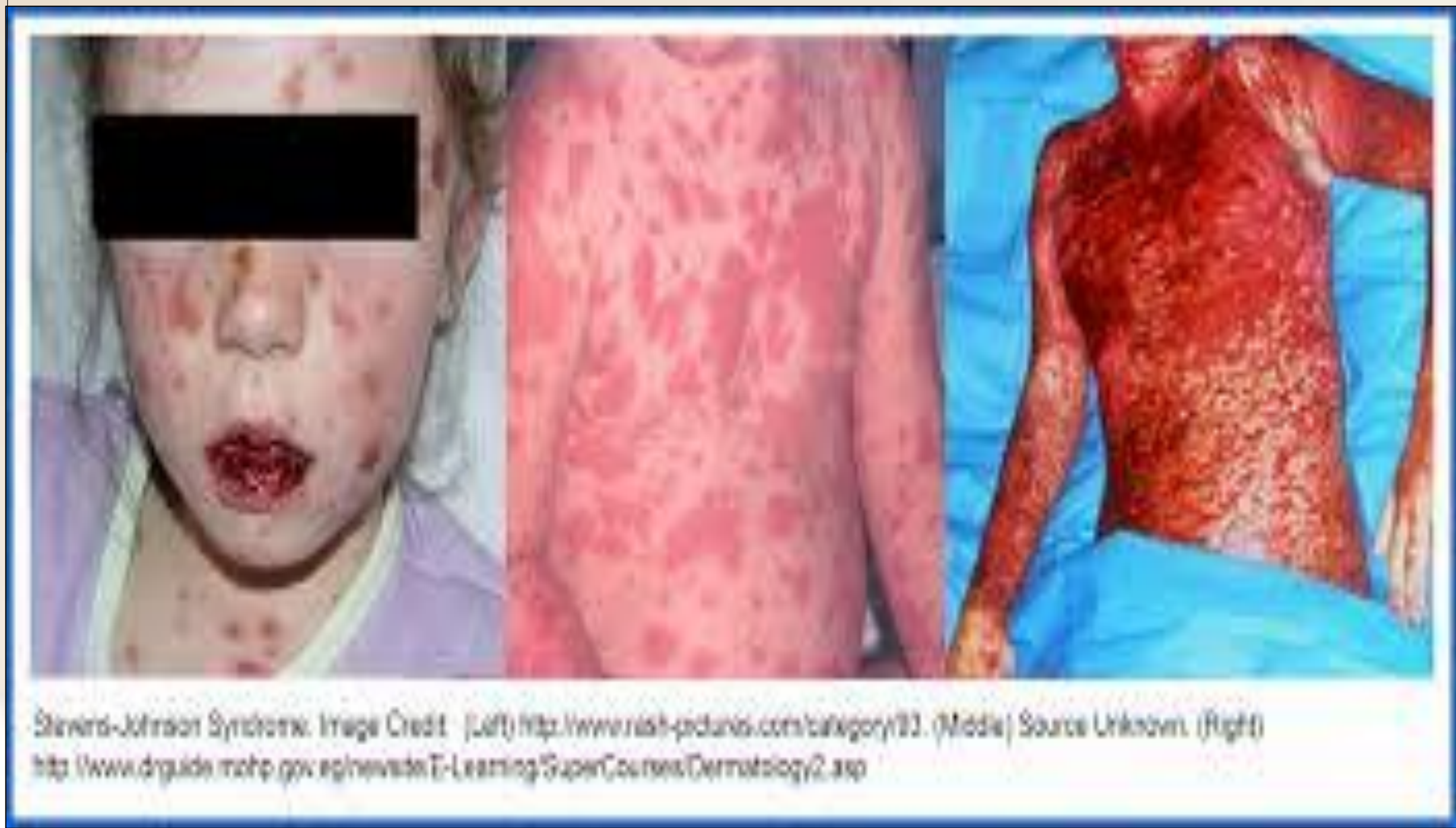
Progression of SJS/TEN