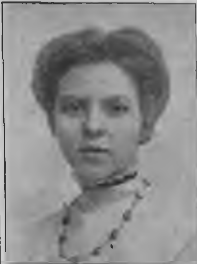
Assistant Director of Art Department.