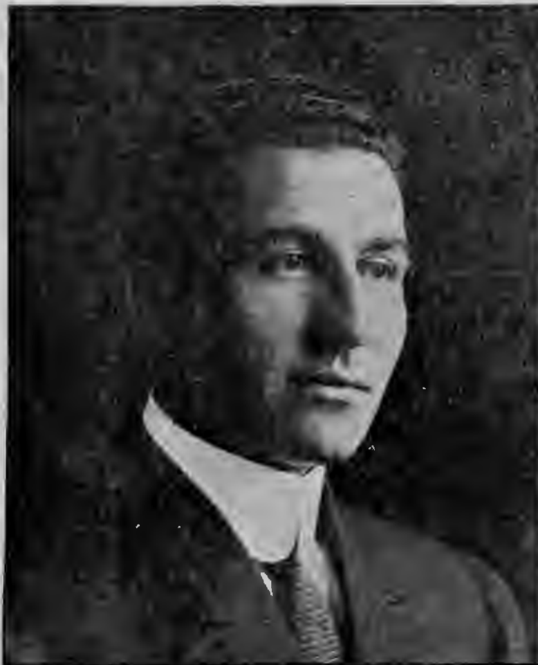
Otterbein's New All-year Coach of Athletics.