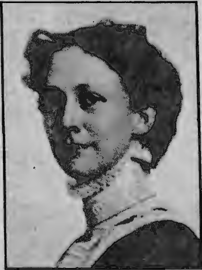
Director of Art Department.