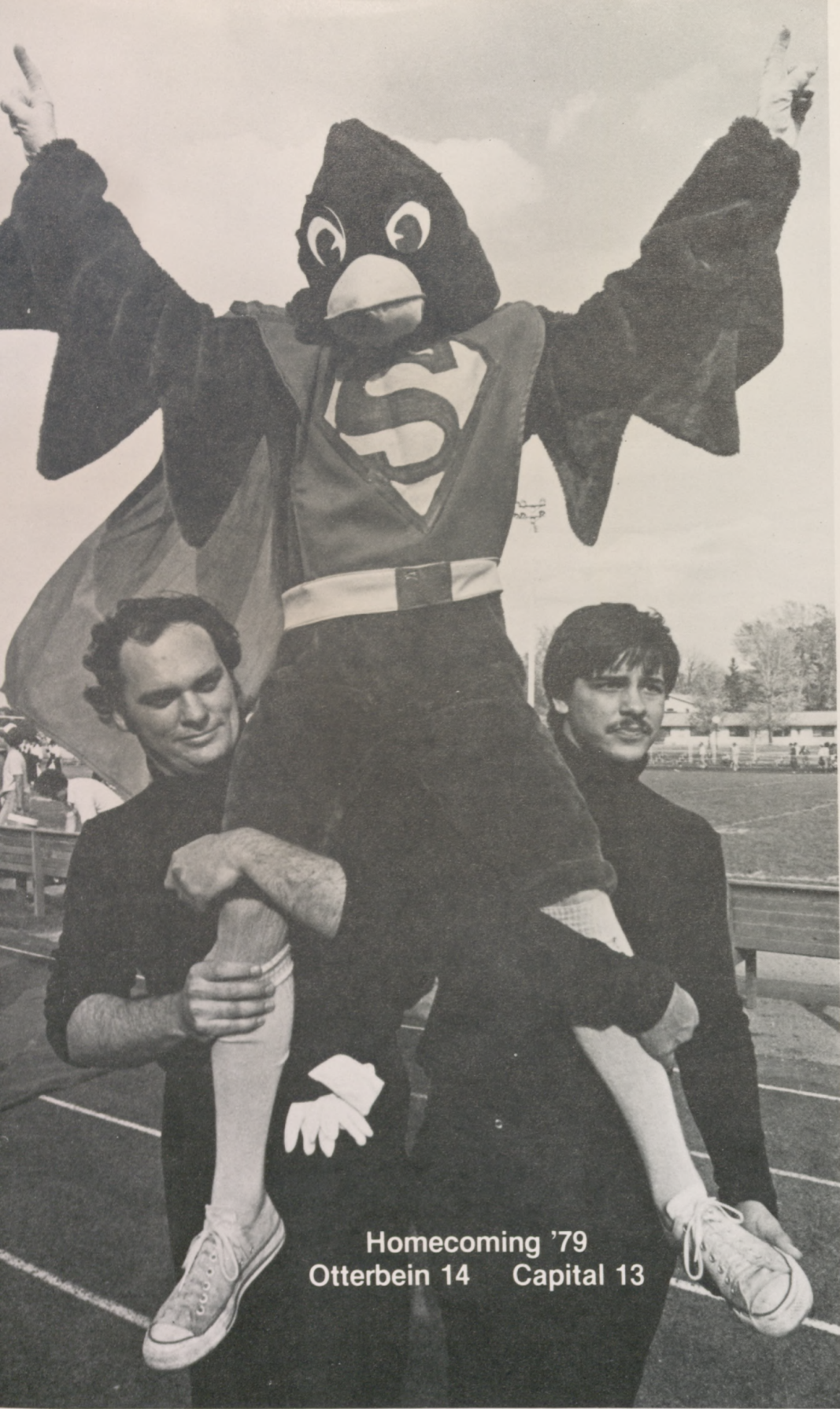
Homecoming '79 Otterbein 14 Capital 13