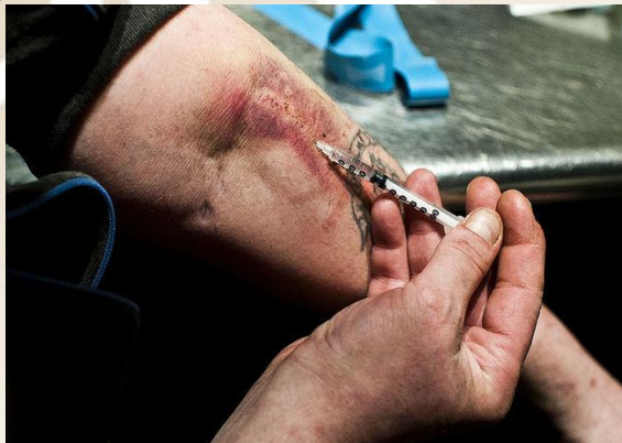
Figure 1. (Agar, 2013)

The use of IV drugs can lead to serious health issues such as: cellulitis, hepatitis, HIV, sepsis, abscesses, pulmonary emboli, and many other conditions. Infective endocarditis is a disease commonly related to IV drug abuse, and is often seen on this nurse's unit. Infective endocarditis occurs when bacteria or fungi enters the blood stream and often infects an individual's heart valves (Peirce, Calkins, Thornton, 2012). Infective endocarditis can be life-threatening and requires aggressive medical treatment. Treatment often includes long term antibiotics, frequent blood monitoring, drug cessation and sometimes heart valve surgery. After treatment these patients have to really consider making lifestyle changes to improve their health and overall quality of life.