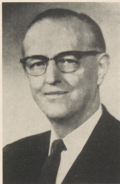
Dr. Walter H. Judd

A feature of Winter Homecoming, Saturday, February 2, will be a lecture by the Honorable Walter H. Judd of Minneapolis, Minnesota. He will speak on the subject, "Where Do We Go From Here." The lecture begins at 2:00 p.m. in Cowan Hall.