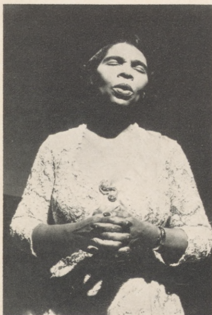
Miss Marion Anderson

Marion Anderson, one of America's great singers, who has become well-known to millions around the world, will present a special Easter Sunday evening concert at Otterbein, April 14, at 7:30 p.m. in Cowan Hall.