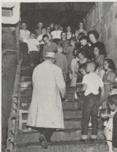
On the stairway leading to the second floor cafeteria lines and dining room.