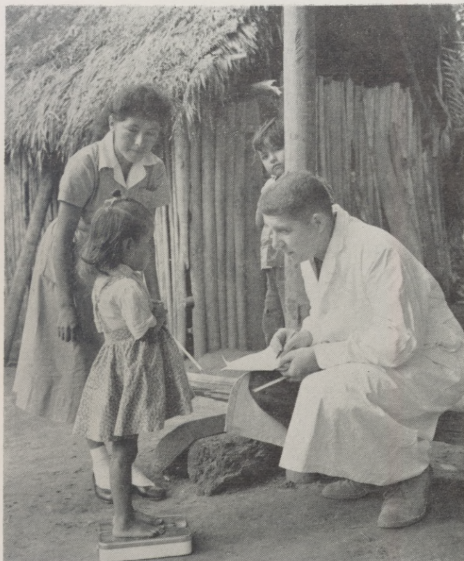
Jungle youngster's nutritional status is checked.