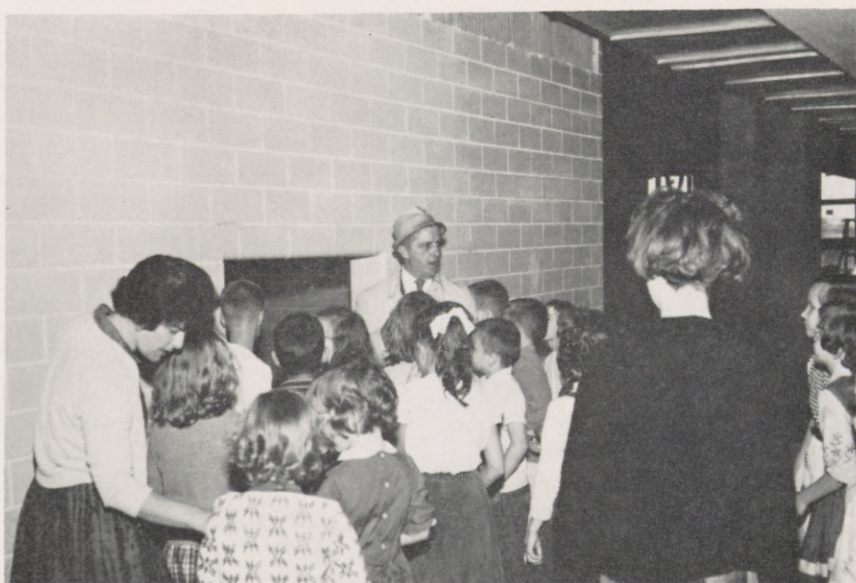
On the second floor where dishes are returned from the dining room.