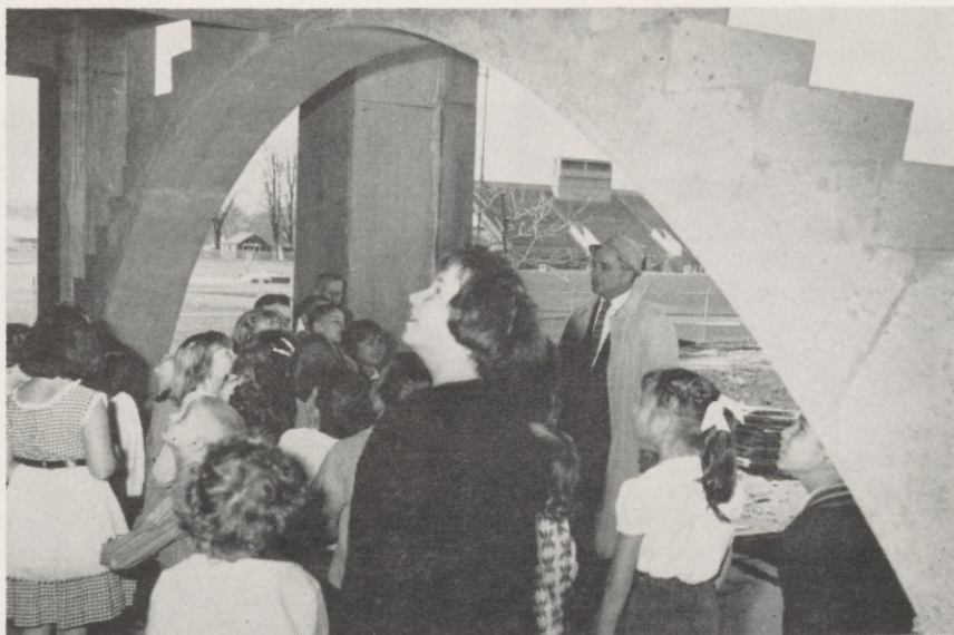
Viewing the northwest section of the new Campus Center Building facing the Stadium.

As you go from the first floor to the second floor you will note there is a dividing bannister in the stairways. This is necessary because it affords a way of dividing the serving lines in the Cafeteria. Since there are two divided stairways, we can serve four lines of students at meal time in our Cafeteria. This means a student can be served in one-half the time he formerly needed at the old Cafeteria—and when you become a college student, you will realize that saving time is most important.