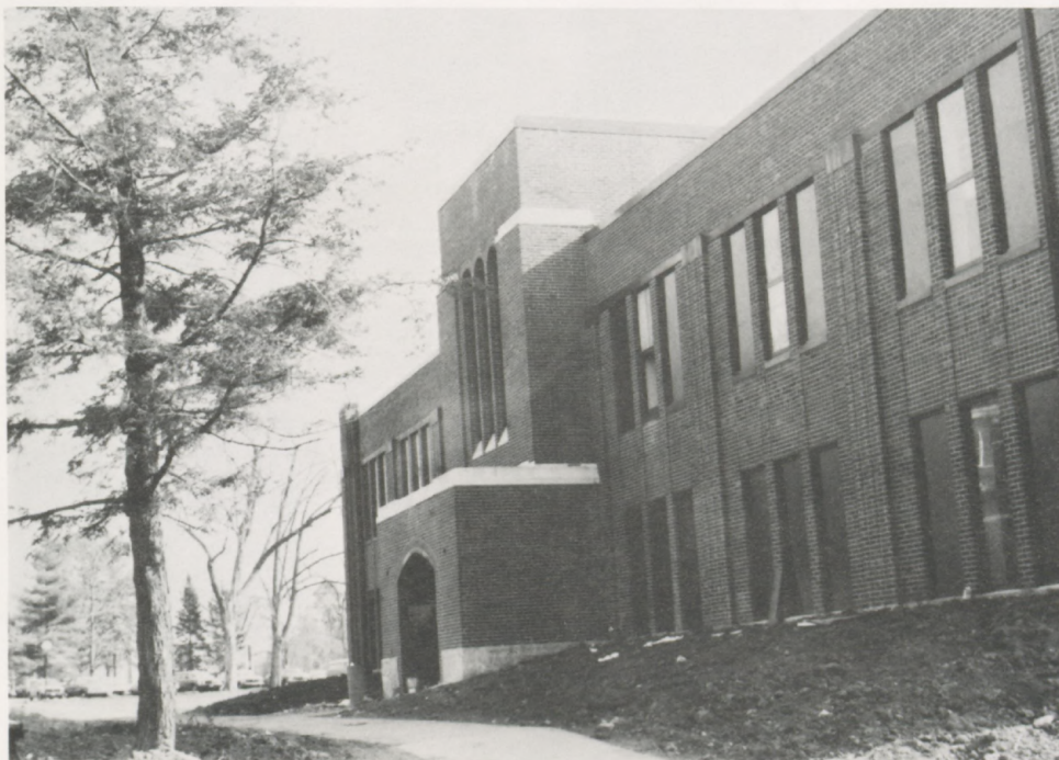
The Battelle Fine Arts Center

"My only concern is that we all keep this year's success in proper perspective. We still have $907,800 to raise before the project is completed. We must continue to strive to reach our goal."