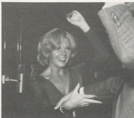
After the 11 o'clock news, Terre enjoys disco dancing.