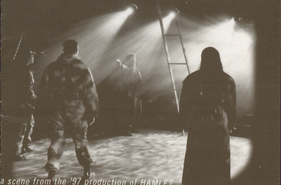
a scene from the '97 production of HAMLET

Two (count 'em two) MUSICALS the Children's play MOLIERE the Dance Concert our fifth WORLD PREMIERE and OTTERBEIN @ the RIFFE CENTER