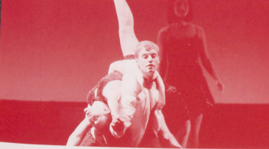
Dance 2009: To Each His Own