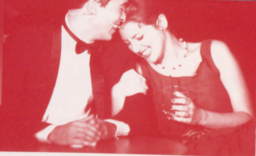
Smokey Joe's Cafe

did you catch them all last year? don't miss out on any of this year's great productions.