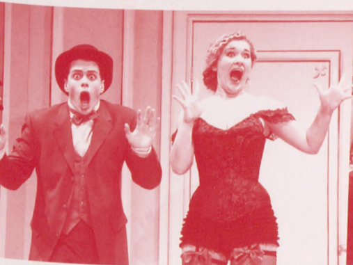
An Absolute Turkey