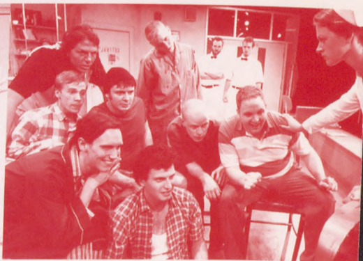
One Flew Over the Cuckoo's Nest