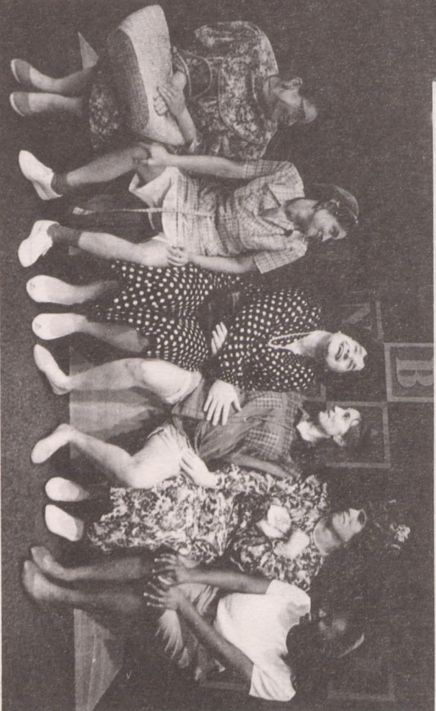
▲ "The Ladies Singing Their Song" — the hilarious second act opener from Baby , last season's charming look at parenthood.

The box office phone number is 823-1109. For more information before June 13, please call 823-1209 or 823-1657.