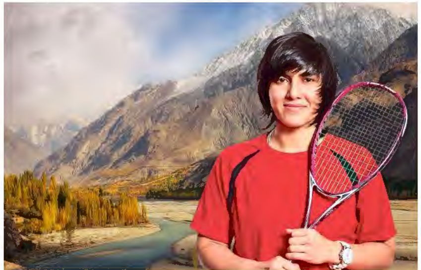
Above: Maria Toorpakai

Maria Toorpakai, the author of this year's Common Book, will be speaking at a special Friends' event on October 22nd at 7:30pm. Ms. Toorpakai, whose memoir follows her journey to becoming the number one female squash player in Pakistan, pretended to be a boy for a number of years in order to evade the Taliban and play the sport that she loved. Eventually she fled to Canada, sponsored by Jonathan Power, the first North American to be named the number one squash player in the world. Ms. Toorpakai will talk about her journey, and more, during this special Friends event.