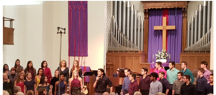
The Otterbein Singers performing "Ya Got Trouble," the famous patter song from The Music Man .

The Otterbein Singers presented their annual concert in March, with a theme of "Music from the Heartland". The Singers performed works from musicals such as Waitress , Big River , Music Man , Bright Star , and more.