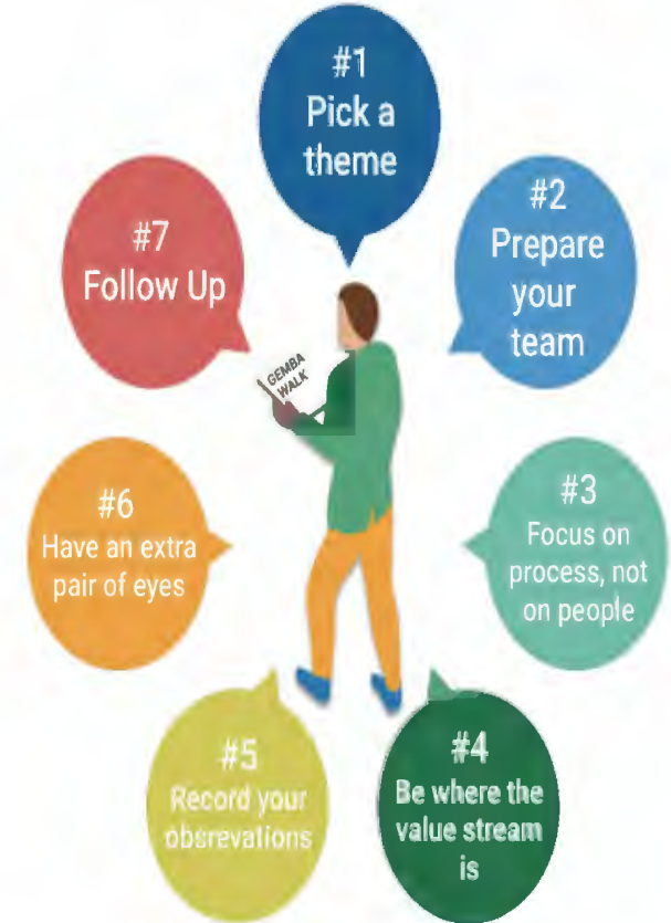
Gemba Walk in 7 steps