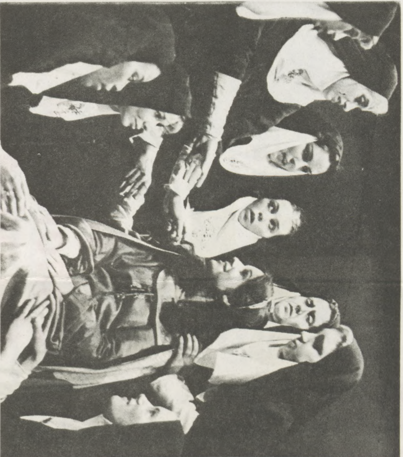
Abelard & Heloise (1982-1983) "A notable achievement whose fine moments are very fine indeed."