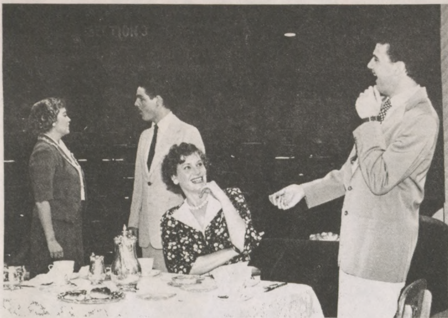
Private Lives (1982-83) "... this version possesses spirit and vivacity." "The appealing lead actors manage the difficult Coward comedy with a good deal of aplomb."