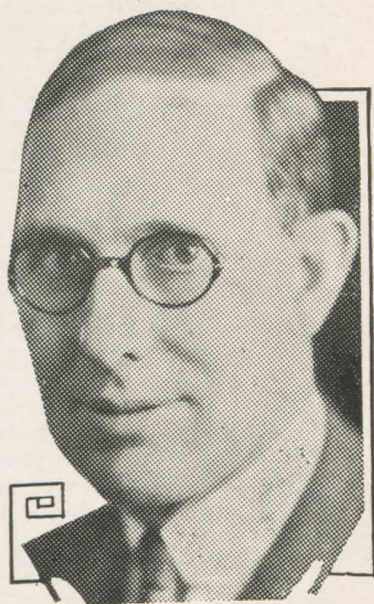
DR. CHARLES F. KETTERING Commencement Speaker