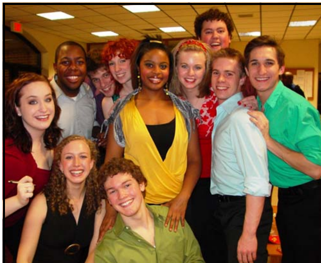
Students from last year's Friends musical event pose for a celebration photo after the performance.