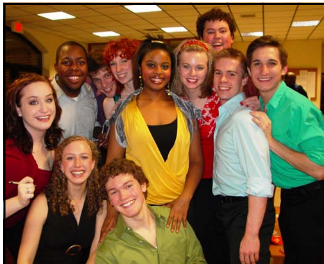
Students from last year's Friends musical event pose for a celebration photo after the performance.