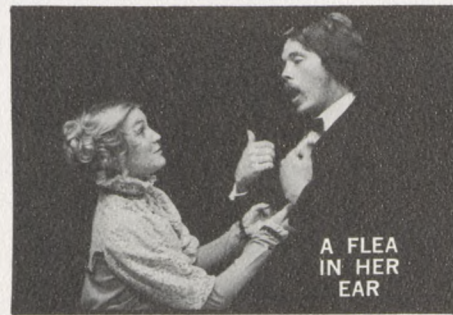
A FLEA IN HER EAR