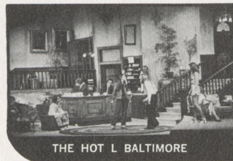
THE HOT L BALTIMORE