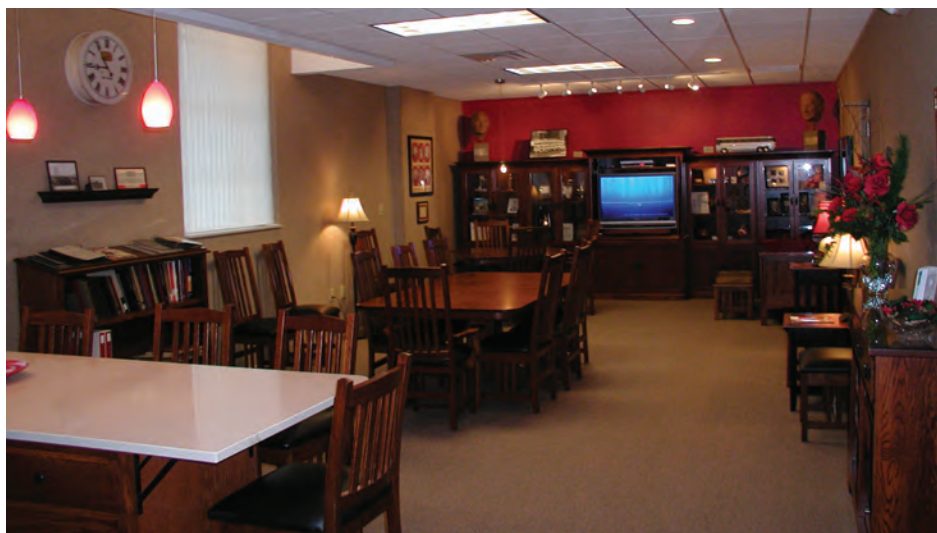
The "O" Club Room in Memorial Stadium is a popular gathering spot for "O" Club members and current and past Otterbein athletes, especially at home football games.