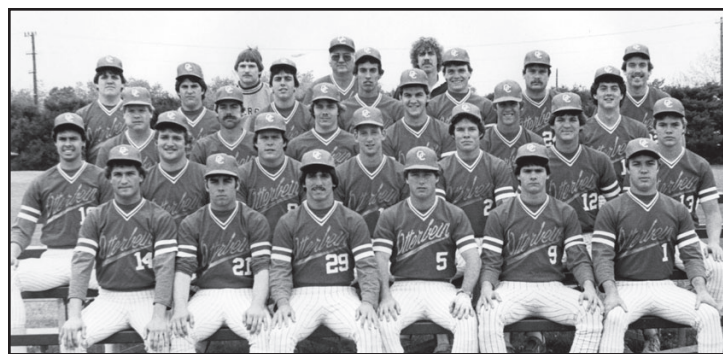
1983 Baseball Team