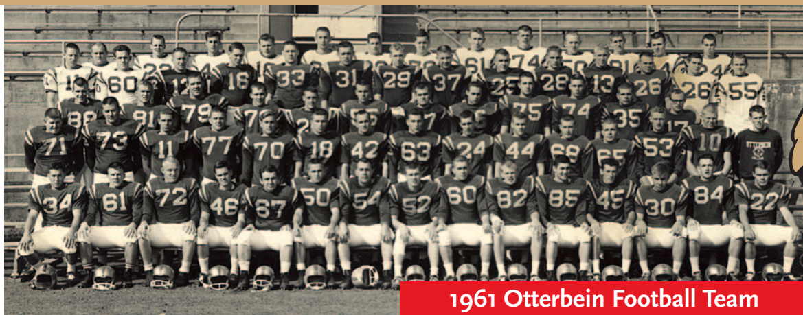
1961 Otterbein Football Team

Non-profit Org. U.S. Postage PAID Westerville, OH Permit No. 177