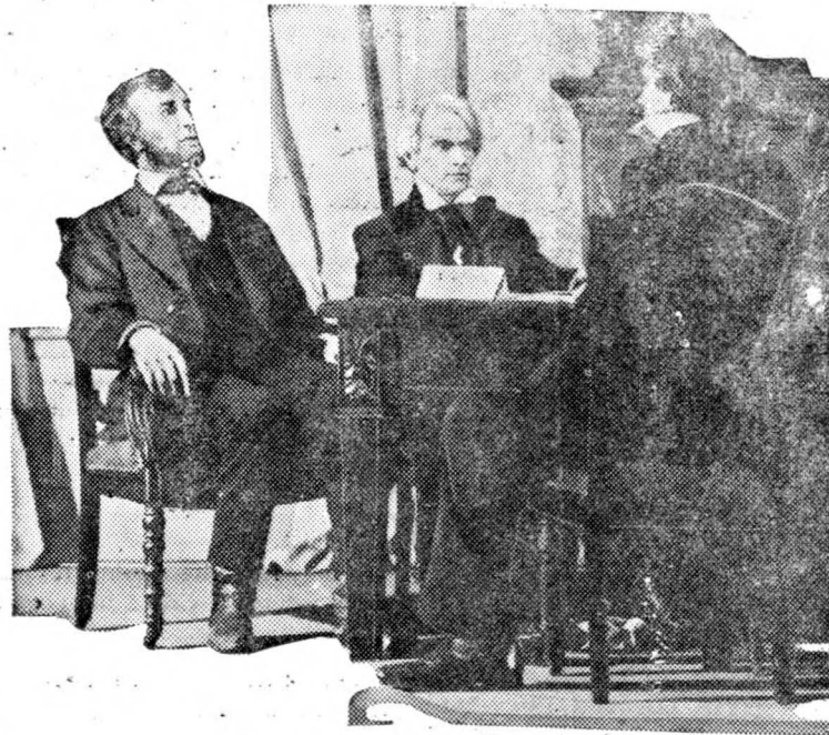
Scene from "Abraham Lincoln"

Otterbein's men's debate teams will clash with the women's debate team of Ohio State university in a dual debate. The time of the events will be decided soon. They will debate on the official Ohio Conference question for the year which is: Resolved, That The Convention System Should Be Substituted For The District Primary. More debates will be scheduled