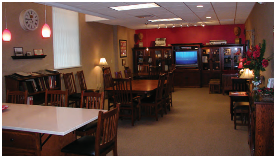
The "O" Club Room in Memorial Stadium is a popular gathering spot for "O" Club members and current and past Otterbein athletes, especially at home football games.