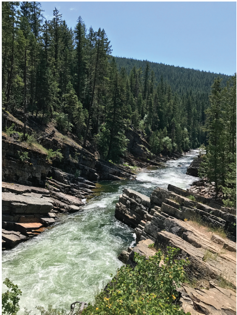
YAAK RIVER MONTANA