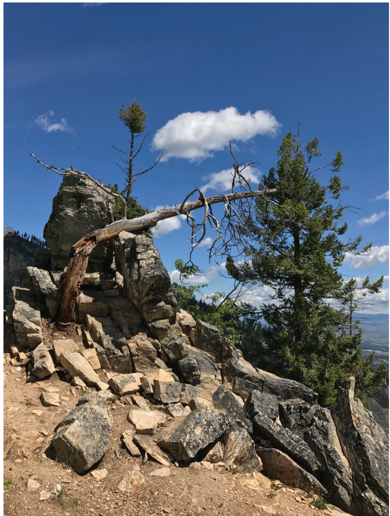
BLODGETT CANYON MONTANA