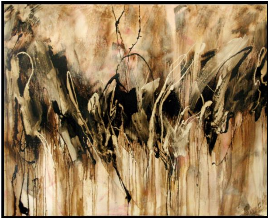
Figure 9. Michael Seiler. "The Asphalt Collection: Dances with Fire #1"