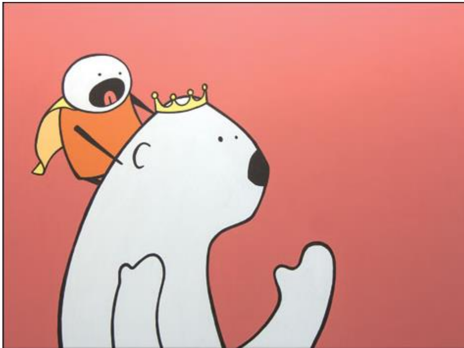
Figure 5. Adam Brouillette. “Ride of a Lifetime”. 48”x36” Latex on panel. 2012