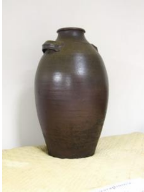
Figure 11. Civil War buttermilk jug.