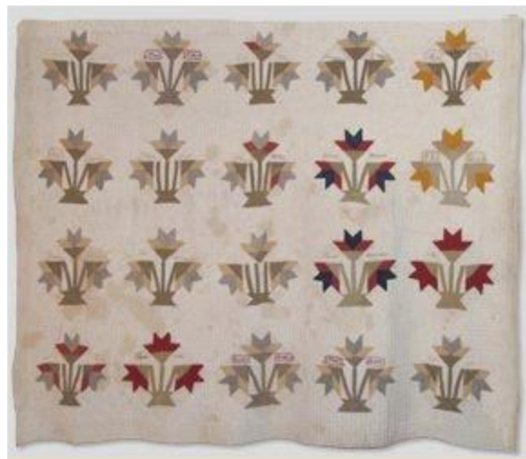
Figure 12. 1888 Friendship quilt.