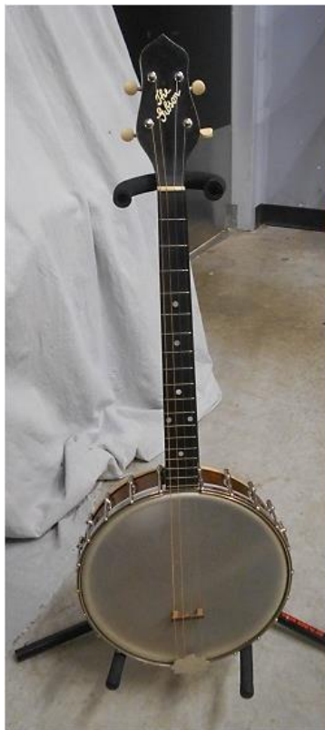
Figure 16. 1925 The Gibson Tenor TD Banjo