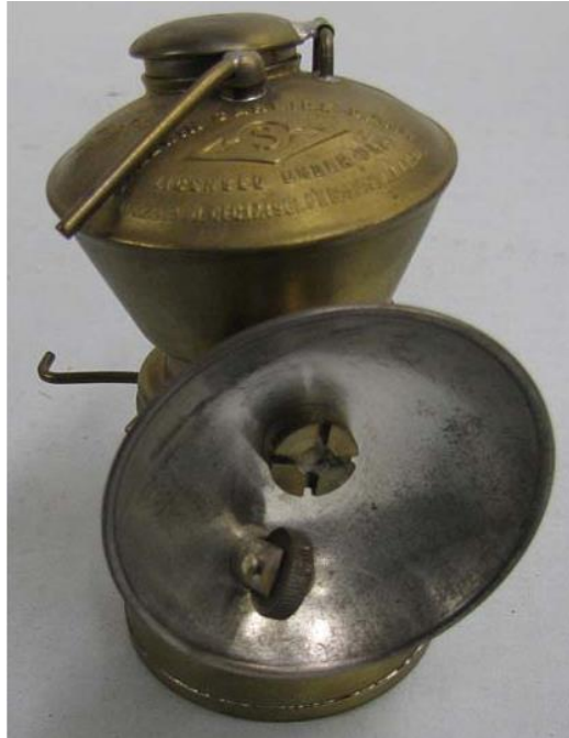
Figure 15. Simmons Carbide Lamp, ca. 1915