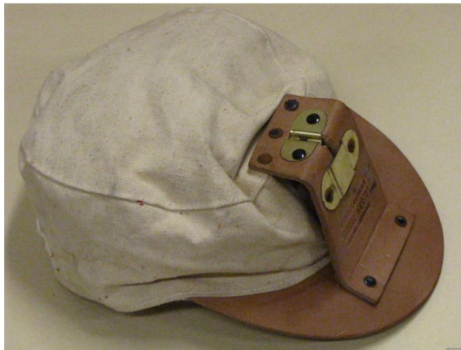
Figure 14. 20th c. Canvas Mining Cap & Lamp Bracket