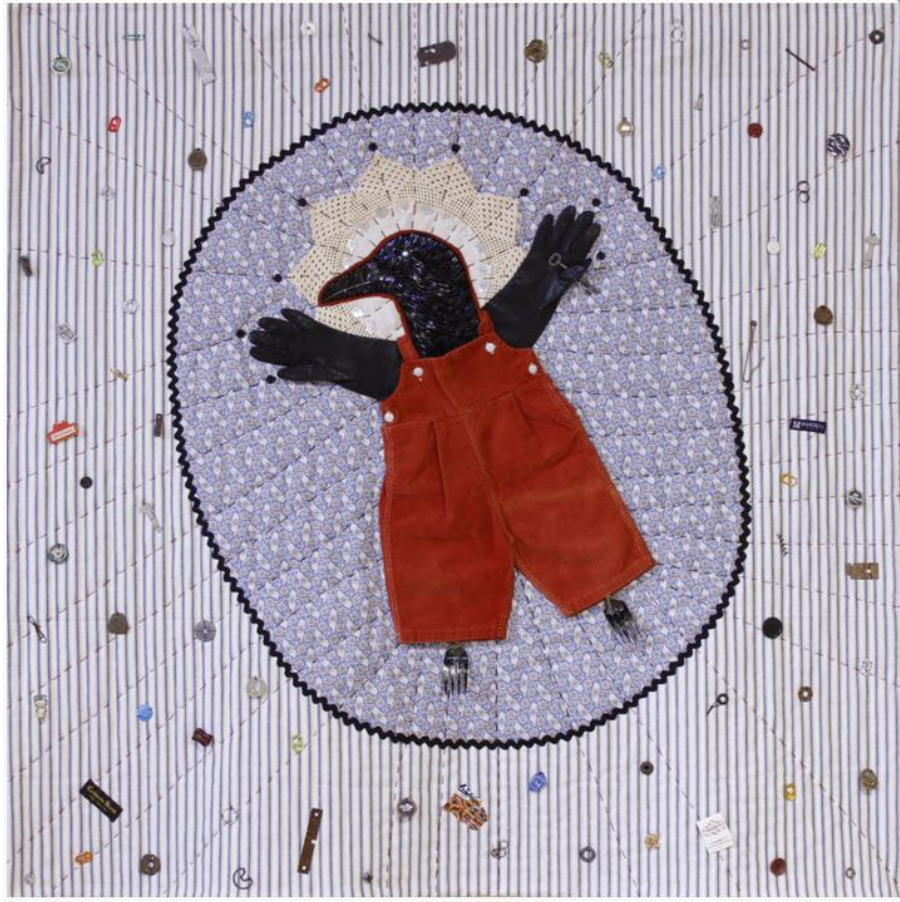
Figure 10. Susan Nash. "Something to Crow About" 54"x54"