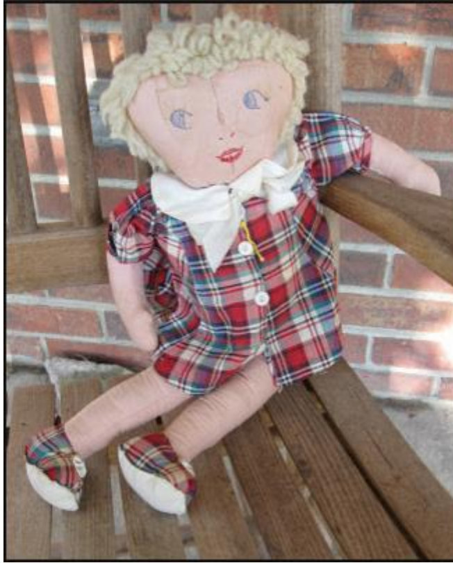
Figure 13. 1940's Cloth doll.