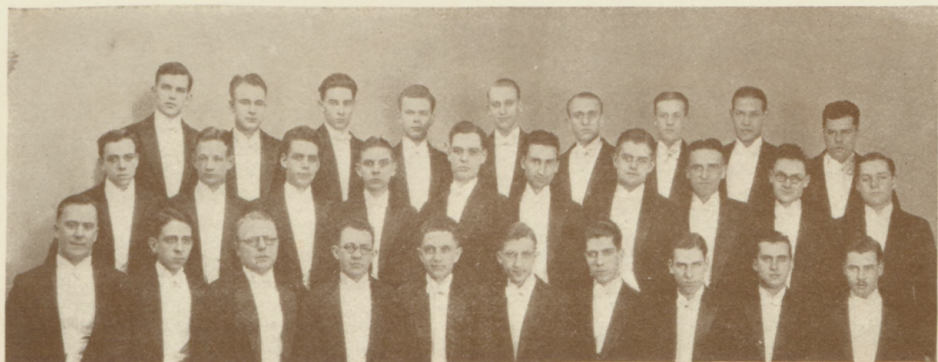
MEN'S GLEE CLUB

Entered as second-class matter at Westerville, Ohio. Acceptance for mailing at Special Rate Postage provided for in Section 1103, Act of October 3, 1927. Authorized July 28, 1918.