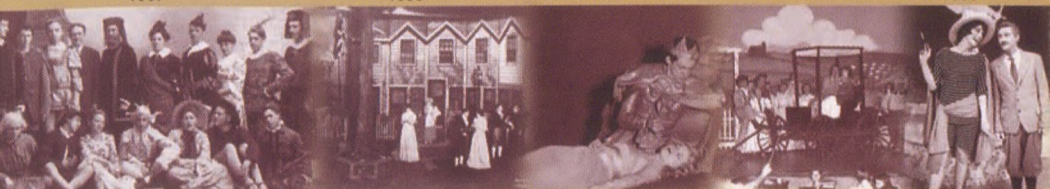
The Boyfriend 1965