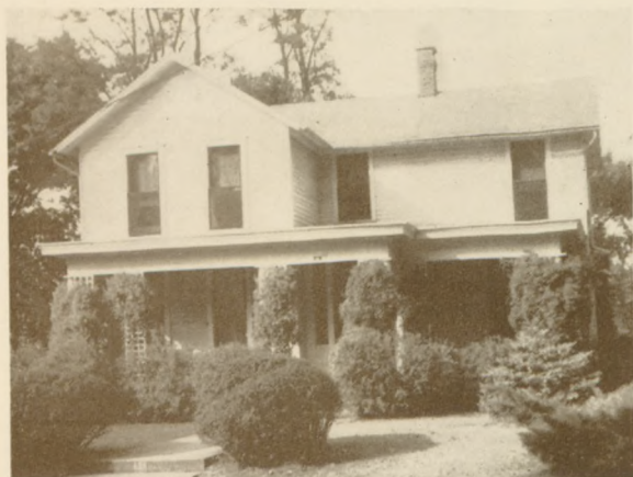
THE PRESIDENT'S HOME AT 47 NORTH GROVE STREET