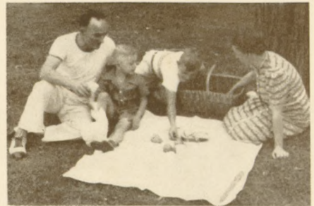
AN INFORMAL NOTE