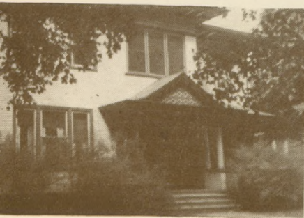
THE CO-OP COTTAGE