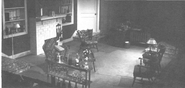
Three-quarter arena setting for "The Gazebo" 1960

Telephone: For reservations, call TU 2-3611, ask for box-office.