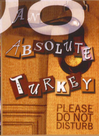
An Absolute Turkey