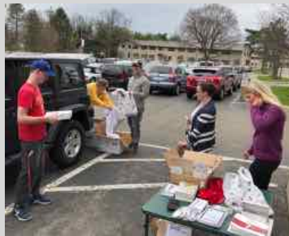
Above: Pre-registration packet pickup for the 5K for K9 Cancer event.