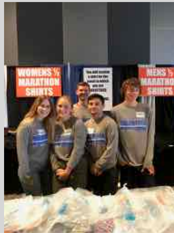
Above: Sport Management majors volunteered at the Columbus marathon.