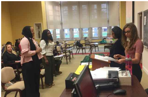
Above: Public Health Education majors were inducted into Eta Sigma Gamma in a ceremony this past spring.