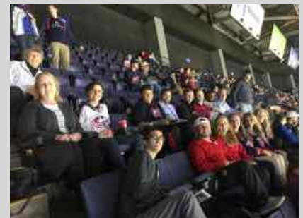
Above: At a Blue Jackets professional networking event.