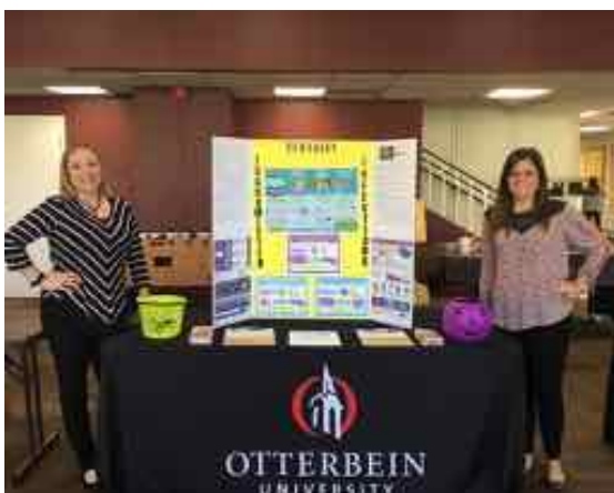
Above: Public Health Education students presented the 2nd Annual Sexual Health Fair in the campus center this fall.