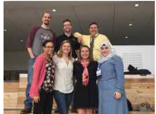
Left: Public Health alumni and current students met for professional development and networking.