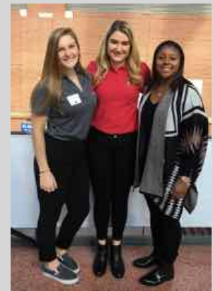
Above: SMGT majors attended Beyond the Baseline "More Than A Game: Women, Leadership, and Sports" in preparation for 2018 Women's Final Four coming to Columbus.