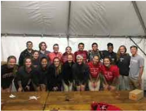
Top: Otterbein Club of Athletic Training Students (OCATS) volunteered as medical support for the Columbus Marathon.

In addition to Athletic Training having a successful year in the classroom, many of our athletic teams were also successful on the field. This success not only provided great extended clinical experiences for our Athletic Training students, but was also in large part due to their efforts throughout the season. When our students weren't in the classroom or on the field in their clinical rotations they were attending professional conferences. This year we had students attend the OATA Student Symposium & Quiz Bowl and the OATA Annual professional meeting.