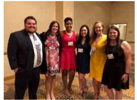
Top: Athletic Training students at the Ohio Athletic Training Conference & Symposium