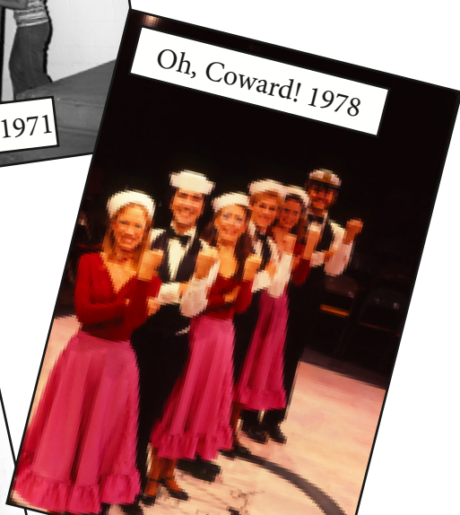
Oh, Coward! 1978