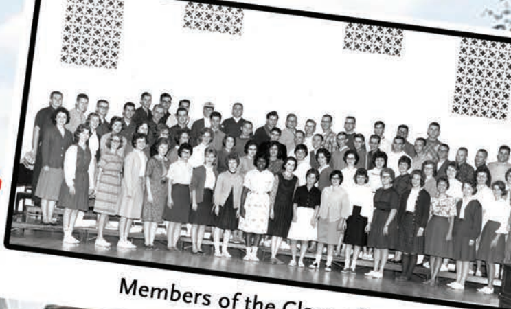
Members of the Class of 1966

PERFORMERS, PASTORS, NURSES, ATHLETES, EDUCATORS, REPORTERS, WRITERS, JUDGES, LAW ENFORCERS, TECHNICIANS, ENTREPRENEURS, VETERANS, AND DOCTORS.