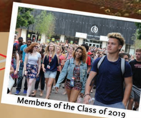
Members of the Class of 2019

They all found their potential at Otterbein. Will you STAND and be counted and give that opportunity and experience to today's Otterbein students?