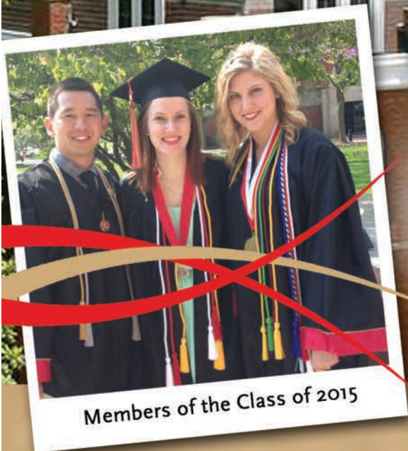
Members of the Class of 2015