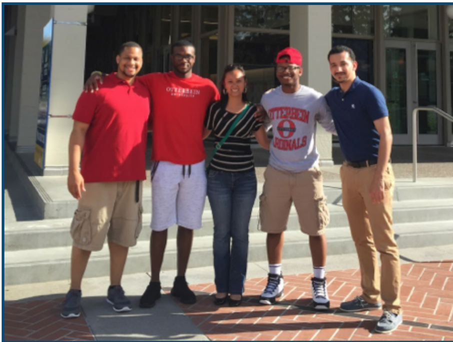
Otterbein representatives attended NCORE in San Francisco to learn best practices regarding issues of race and ethnicity.