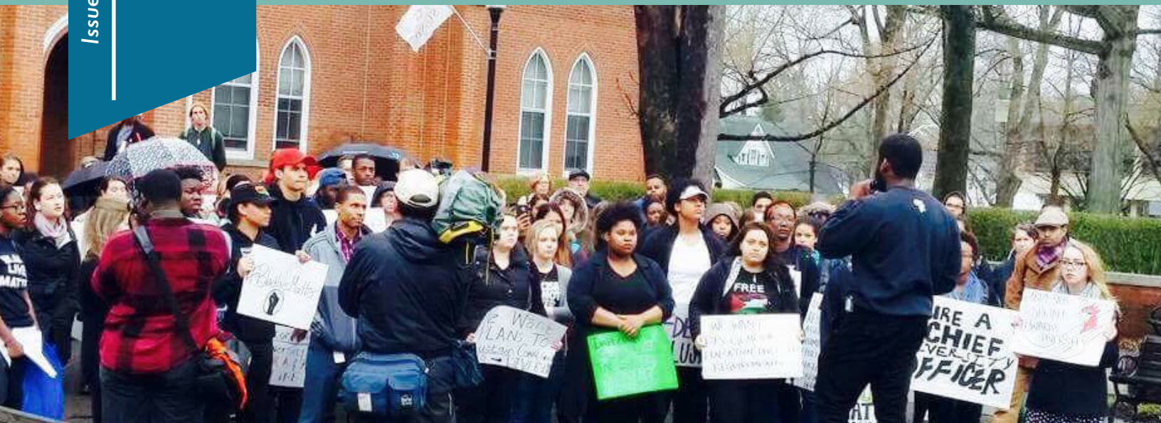
Scores of students rally in front of Towers after an ugly incident of racism that occurred in a residence hall. Administrators promise action.

Otterbein's Office of Diversity: Making the Invisible Visible