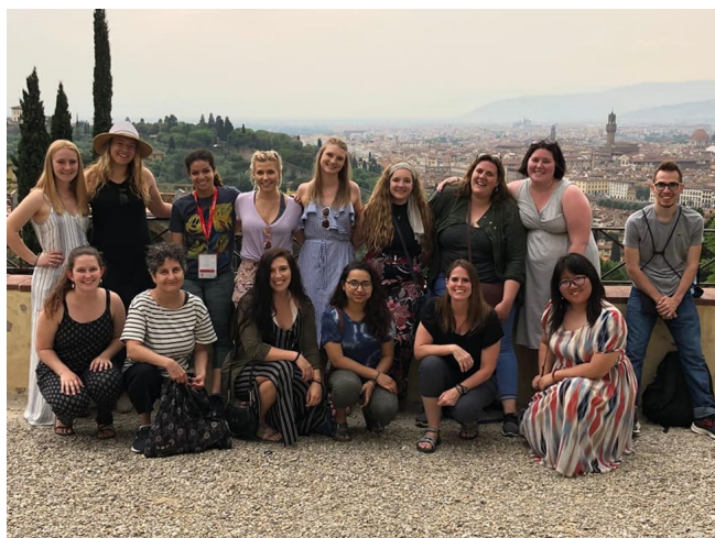
May 2018 Italy travel course participants in Florence

The group then spent five days in Florence, where they visited two restoration laboratories: one at the Cattedrale di Santa Maria del Fiore, more commonly known as the Duomo, and the other at L'Opificio delle Pietre Dure, which is the laboratory associated with the Uffizi Gallery. They had an additional free day to visit a nearby city, including Pisa, Sienna or Lucca.