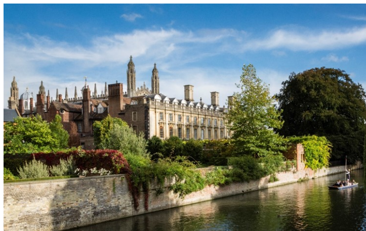
A view of Cambridge University along the River Cam