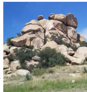
Arizona scenery.