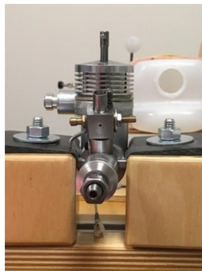
The small diesel engine in which the biofuels are tested.

These experimental modules build on student research completed by Mallory Gasbarre (Class of 2017) and Maithri Kora (Wellington School, Class of 2018).