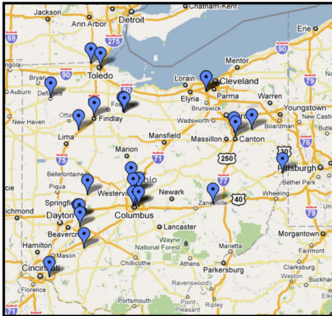
Locations of OPAL Libraries