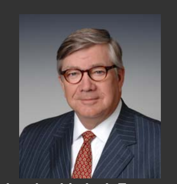
Leadership Isn't Easy

How often have you heard "leaders are made not born," but what goes into "making" a leader? Leadership isn't easy, but with a personal commitment & perseverance, you can start down the road to being an effective leader. This session will present ideas to help you improve as a leader or begin the journey toward developing effective leadership skills.